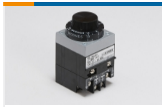
Time Delay Relays(176)